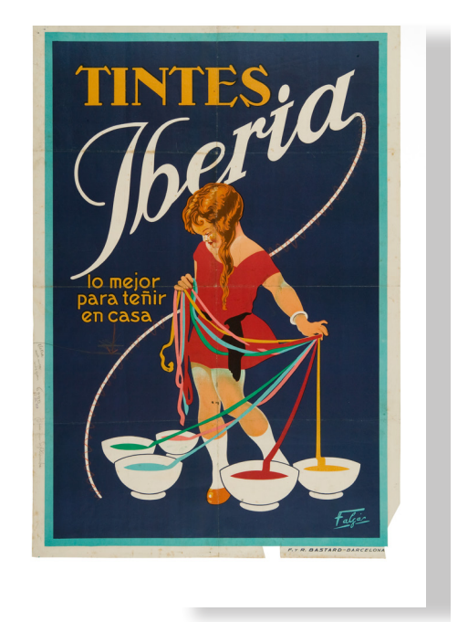
Poster Tintes Iberia, 1950