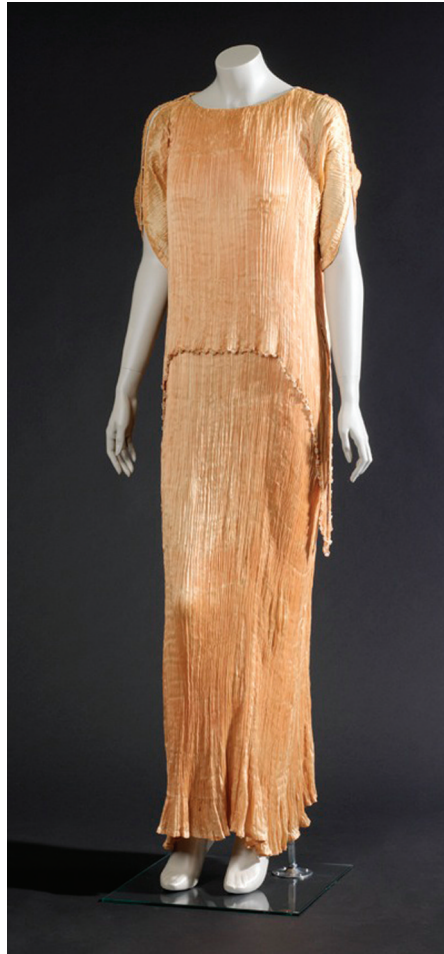
Mariano Fortuny, Delphos tunic, 1909.