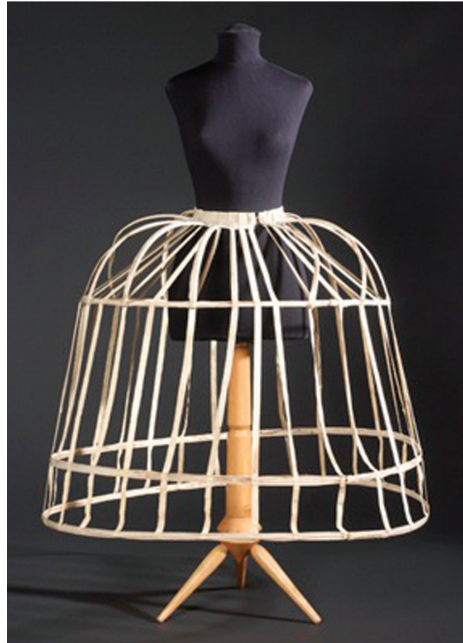
Crinoline, c. 1858.

1. Increase: creates volume by added structures, stiff fabrics or tailoring that separate the garment from the body. The figure is widened: guardainfantes, hooped petticoats, crinolines, bustles and capes.