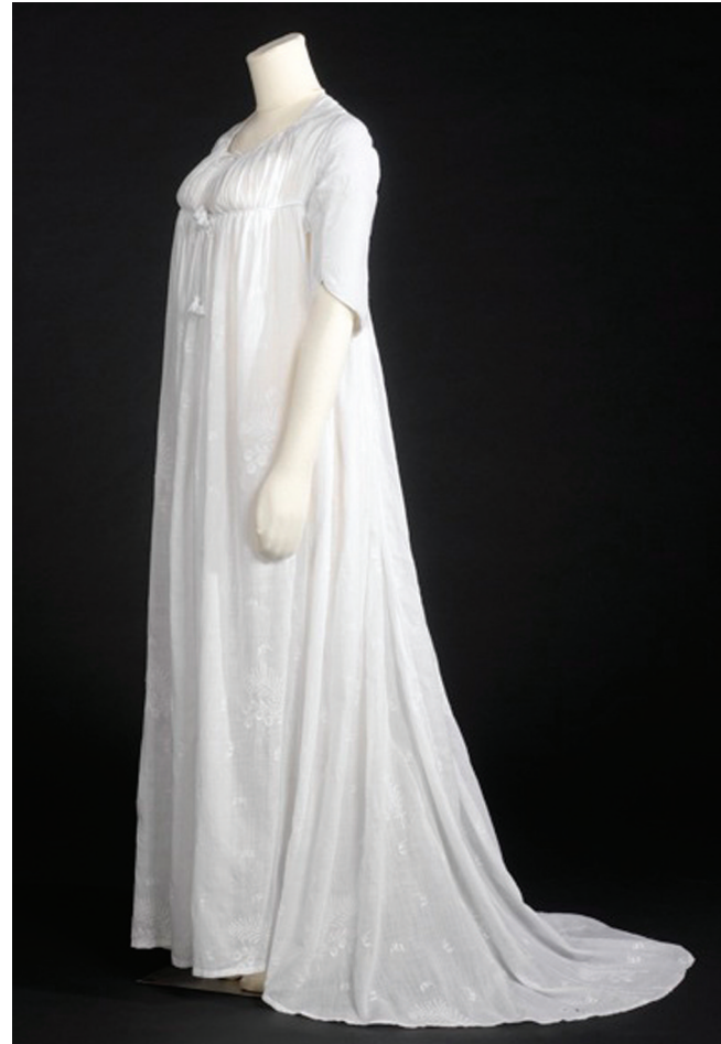
Dress, end of the eighteenth century–beginning of the nineteenth century.

3. Lengthen: stylizes the body so that it seems taller. Lengthens the body: high heels and platform shoes, hairstyles, hats and coat tails.